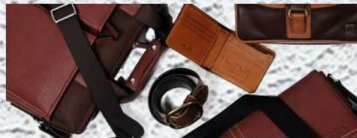
Miscellaneous Leather Accessories