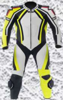
Leather Moto racing dress (TTP)

The major exported items of Pakistan Leather Garments/ goods include Jackets, Gloves, Hand Bags and Moto-racing garments.