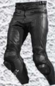
Motor Cycle Leather Racing Pants