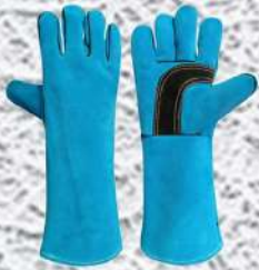
Leather Welding Gloves