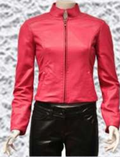
Female Leather Jacket