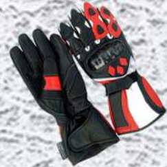
Leather Moto racing Gloves